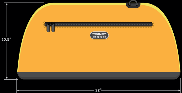
keep fully expanded whenever possible