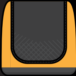
sturdy privacy mesh on 3 sides